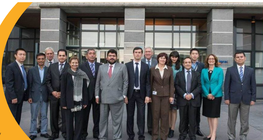
Participants of a Rotary-sponsored Central Asia workshop on preventive diplomacy for transboundary water management.