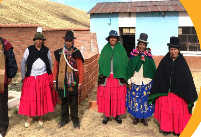
Recipients of the Rotary-sponsored Comanche Eco-sanitation project in West-Bolivia.